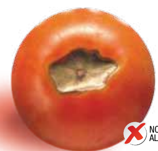
■ Blossom-end rot